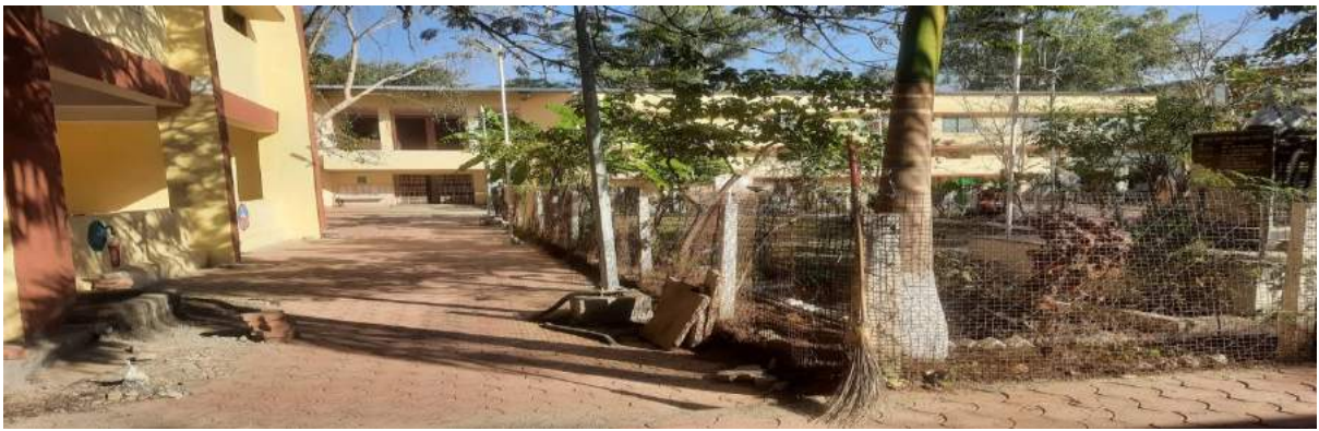
Divyangjan-friendly, barrier free environment